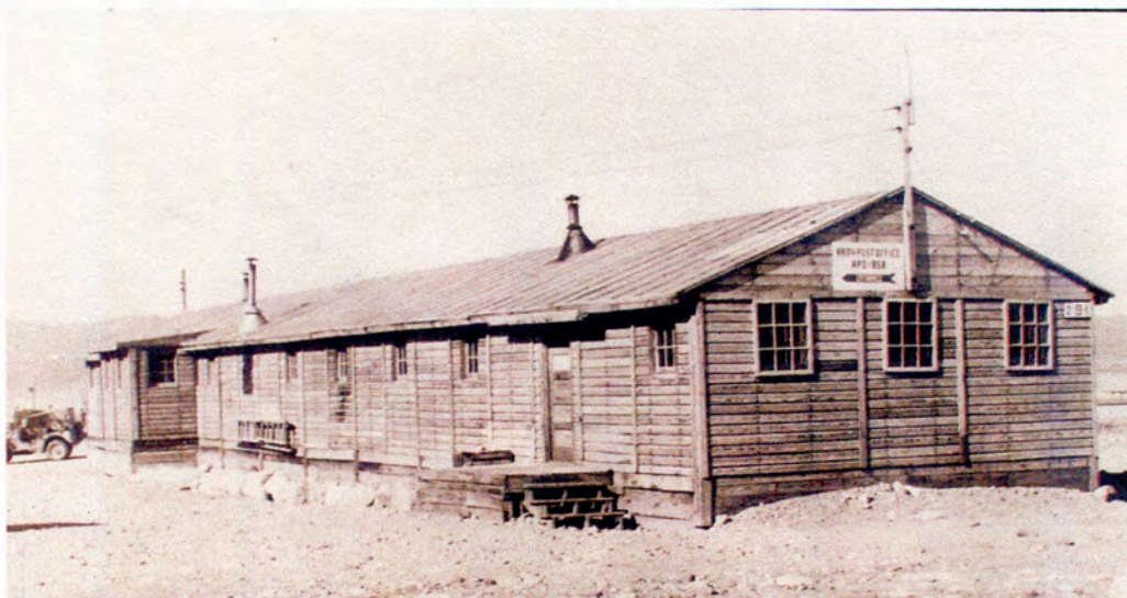
The APO 858 Post Office at Narsarssuak in 1944