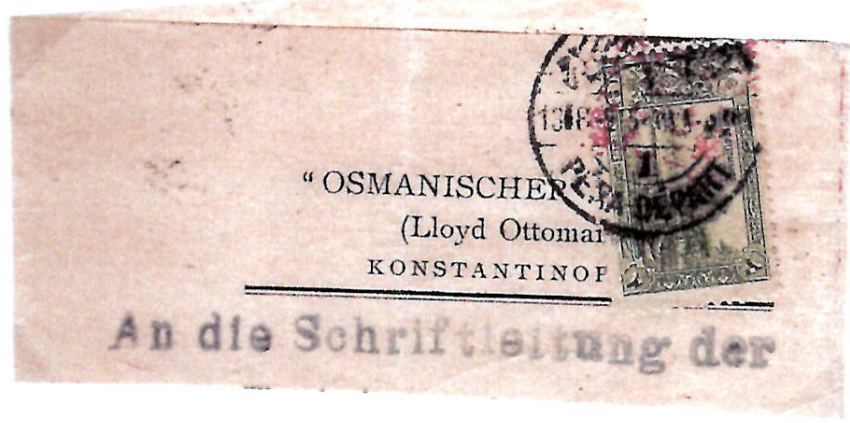
Early 1914 use to: An die Schriftleitung der ( Trans.: Editorship ) Unknown destination w/ 10 paras postage stamp issued Jan. 1914

1st London Printing 35 x 24mm Green Perf. 12 View of Lighthouse