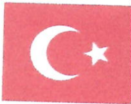
Ottoman Empire Flag

The Osmanischer Lloyd was a German-Language daily newspaper in Ottoman Constantinople which was founded after the Young Turk Revolution in 1908. Between 1908 & 1915 the newspaper was published as bilingual outlet, w/ each issue having two pages containing French articles. From November 1915 onwards, there were two 4-page newspapers, one in German language & other in French language. The funding was provided by the German companies Krupp & Deutsche Bank.