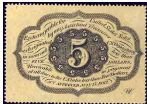
Figure 4. Both sides of the Postage Currency note that Scott catalogs as PC1. The front shows the then-current 5¢ Jefferson postage stamp. The reverse, printed by the American Bank Note Company (note their ornamental logo at lower right) shows a large numeral 5, surrounded by twelve smaller 5’s within a scallop-edged ornamental lathework design.