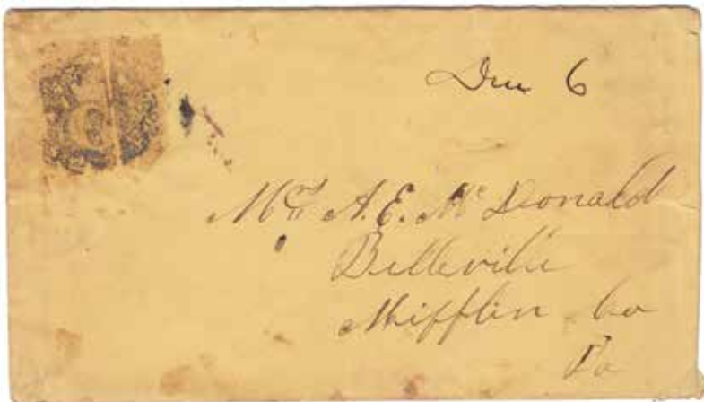
Figure 1. Stampless cover to Belleville, Pennsylvania, with no postal markings other than the manuscript Due 6. Affixed at upper left is a Loewenberg-style decal showing a reverse numeral 5.

The decal affixed at upper left is printed in black ink and cut to shape (26 x 26 mm) with a central reversed numeral 5 (12 x 8 mm) surrounded by 12 smaller 5’s (2.2 mm high), all within a scallop-edged engraved lathe-worked field. The enlargements in Figure 2 show these features more clearly. The left image in Figure 2 is a blow-up of the decal. At right in Figure 2 is a mirror-image of the same scan, which shows the decal in reverse. The black-