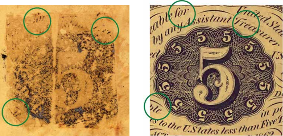
Figure 5. At left: enlarged mirror image of the cover decal (see Figures 1 and 2) with salient design elements encircled in green. At right, a close-up of the comparable portion of the Postage Currency note engraved and printed by ABNC (see Figure 4). The designs are identical. The green circles highlight duplicated elements, confirming the match: the word “for”; “Trea” from Treasurer; and “ble” from Receivable.

In his Chronicle article Hofmeyr pointed out another MacDonough-Zevely letter from the Brazer-Finkleburg archive. This one is dated 28 November 1863, and it revealed a lot. Multiple NBNC experiments with Loewenberg’s concepts had not gone well. Loewenberg abandoned the results half-finished from lack of progress and support by the NBNC, and he began shopping his process to NBNC competitors. It is likely he first approached the Continental Bank Note Company but no resultant essays have surfaced. Subsequently, he approached ABNC. How do we know this? In 2016, Hofmeyr discovered an engraved Loewenberg decal created from the same ABNC die as an uncatalogued variety of Scott 65-E7A. 2